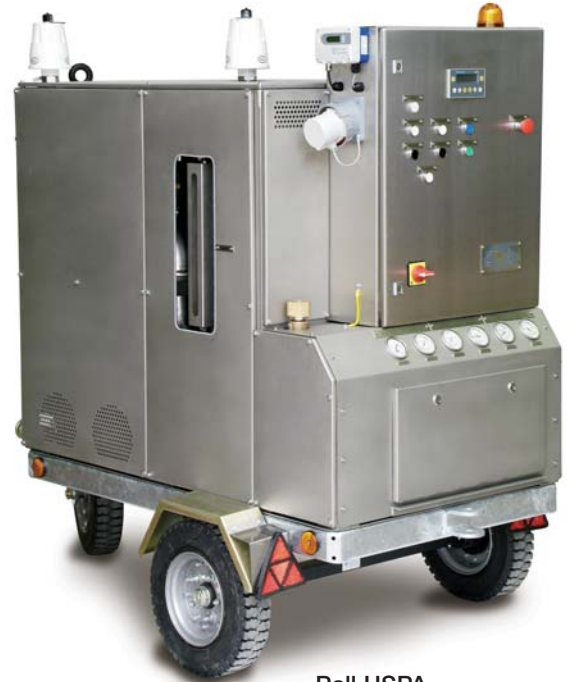
Pall HSPA Hydraulic Fluid Purifier

This unit has provision to connect a Pamas 3 S40 particle counter and contains suitable mounting position, electrical and hydraulic points for customer connection. The Pamas S40 is not supplied as standard with the HSPA181 purifier unit. For further details of the Pamas S40, please contact the Pall sales office